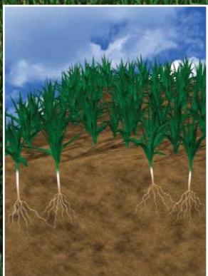
All Other Fescues